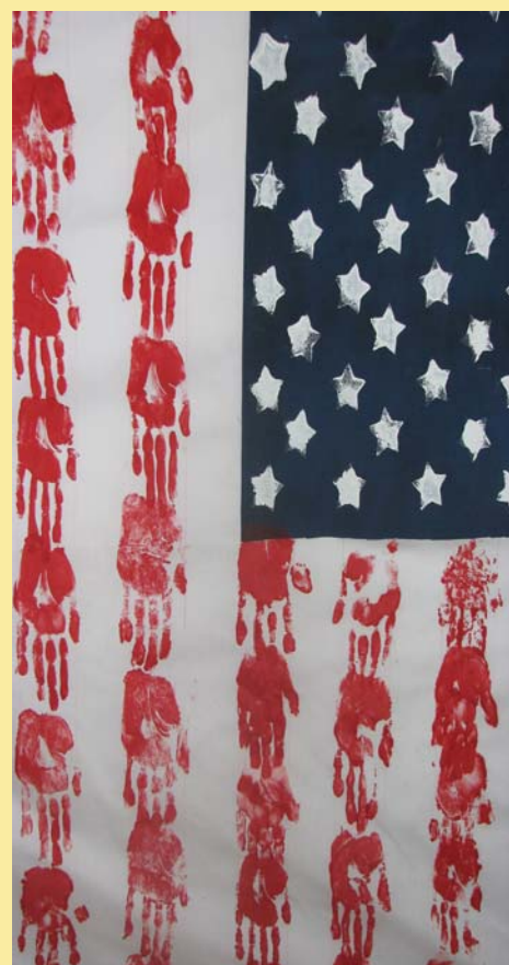
artwork by Wayne ARC participants